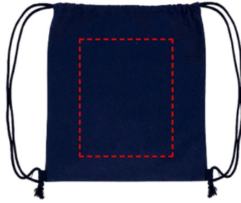
FRONT CENTER AA